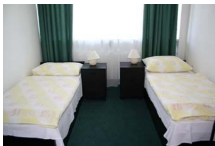
A room in * hotel